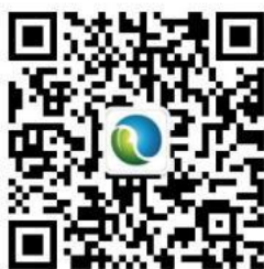
Wechat Public Platform

Ordering Information: order@rengenbio.com