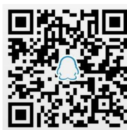
Exosome Research Exchange Group